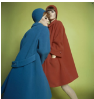
Hans Dukkens Winter Fashion Shoot for 'DeTelegraaf', 1966 (printed in 1996) Baryta fine art print 37 x 37 cm € 350