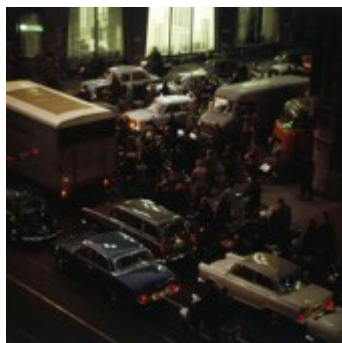
Paul Huf Crossing Raadhuisstraat and Spuistraat, Amsterdam, 1963 (printed in 2017) Fine art print 38 x 38 € 325