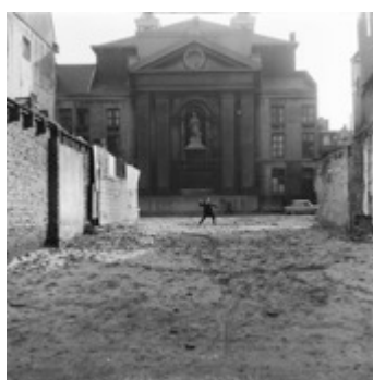
Jaap Pieper Mozes and Aaron Church, Amsterdam, 1963 (printed in 2011) Baryta fine art paper 38 x 38 cm € 350