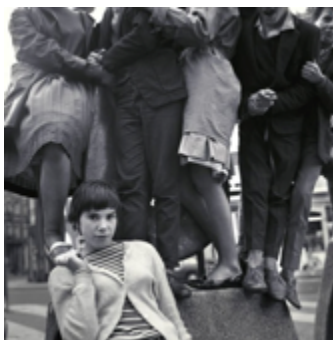
Carel Blazer Playground Vrolijkstraat, Amsterdam, 1961 (printed in 2011) Baryta fine art paper 24 x 24 cm € 300