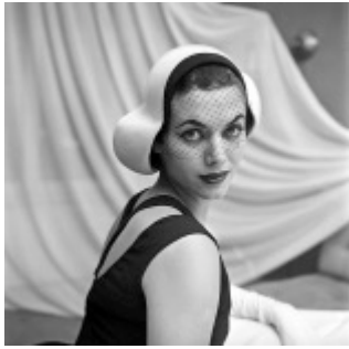
Hans Dukkens Evelyn Orcel showing couture by Dick Holthaus, 1957 (printed in 1996) Baryta fine art paper 36 x 44 cm € 350