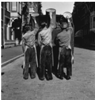
Eva Besnyö Garbage men in the Alberdingk Thijmstraat, Amsterdam, 1950's (printed in 2011) Baryta fine art paper 24 x 24 cm € 300