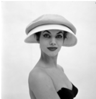
Hans Dukkens Evelyn Orcel showing couture by Dick Holthaus, 1956 (printed in 1996) Baryta fine art paper 37 x 37 cm € 350